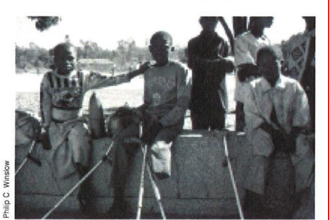
Landmine survivors in Luena, Angola

Today, that notion apparently no longer holds true. In its 1998 Hidden Killers report, the U.S. State