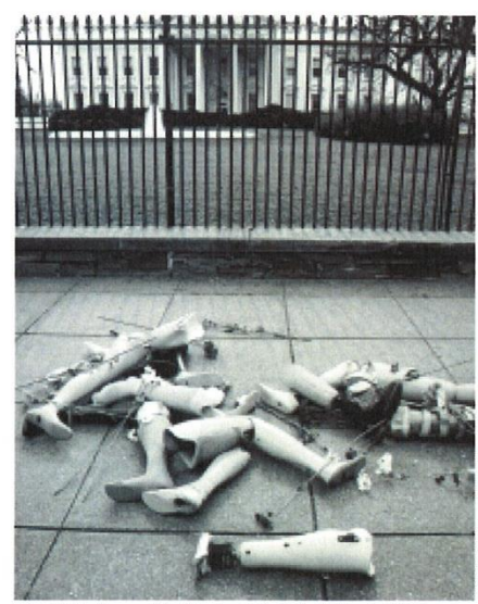
The White House, Washington DC, USA, 1 March 1999

The United Kingdom's Landmines Act Section 5 similarly provides a defense for those who participate in a military operation "wholly or mainly outside of the United Kingdom" and "in the course of which there is or may be some deployment of antiperson-